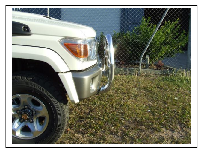
Figure 4 – Side view shown