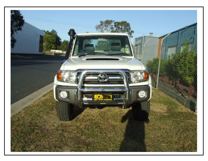
Figure 3 – Front view shown