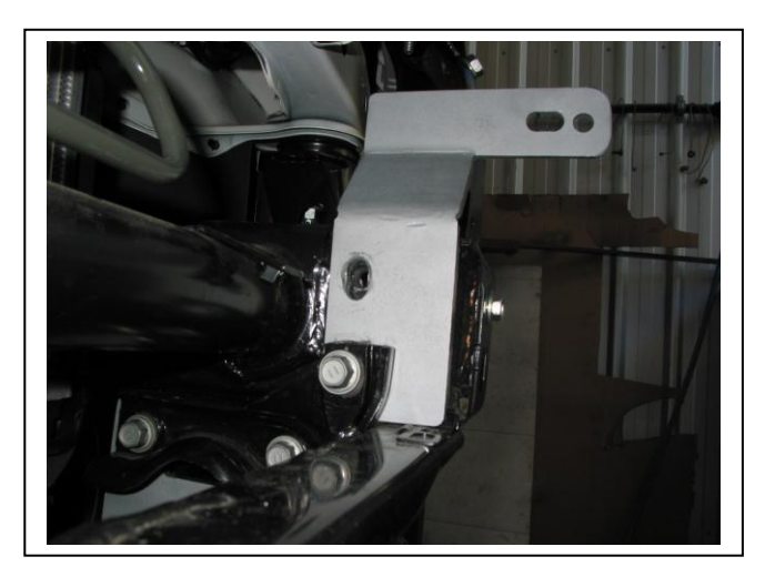
Figure 1 – Passenger side shown (bumper removed for photo)